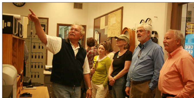
Above, APA members tour the Eklunta Hydro Plant.