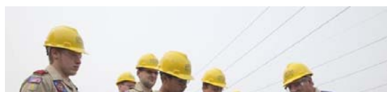
Golden Valley Electric